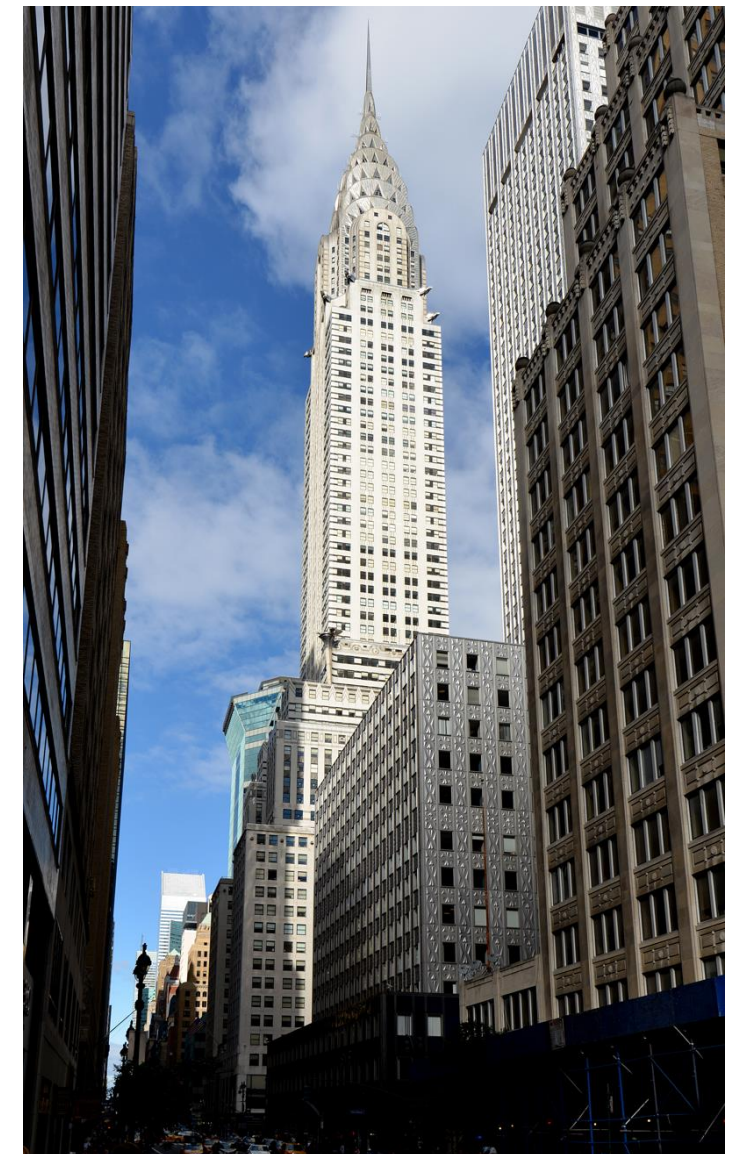
Chrysler Building 2020

Unlike his predecessors, Horter chose to place the Chrysler Building in the background, yet it is a focal point bathed in the bright morning sun. The dark buildings in shadow bring your eye down to the people in the foreground rushing by on their way to work.