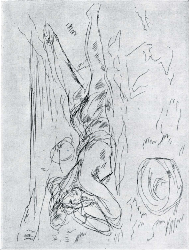
No. 55 Woman Lying on the Sand ANDRÉ DUNOYER DE SEGONZAC